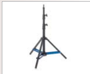
American heavy-duty "C" stand FGS-900073