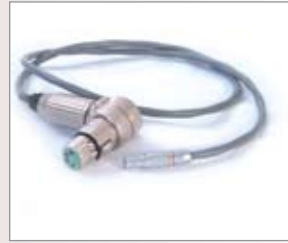
12v camera power cable 078-7351