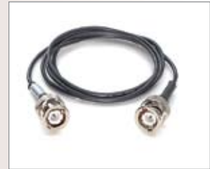
3 ft. light weight BNC video cable (BNC to BNC) 078-4122-01