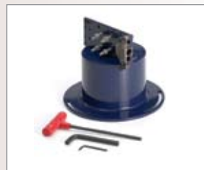
Vehicle mount kit 078-7401-01 (pictured) with steel socket block 078-7401-02 with ProVid socket block 078-7401-03 with Flyer socket block