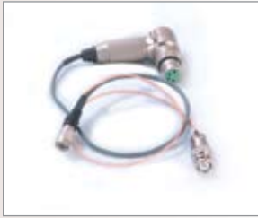
6 pin Hirose to 12v power and BNC video 252-0120