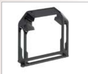
WRC4/Seitz receiver and amplifier bracket 250-7916