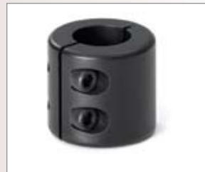
Locking spinning collar for Ultra/MS arm post 250-7211