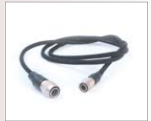
SONY XC-75 video tap power & video cable 250-0057