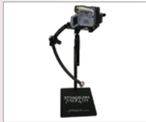
Table Top Stand (Merlin) 801-7910