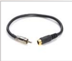
Video cable (S-video to RCA) 250-0127