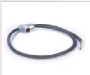
24v power cable (lemo & open end) 250-0046