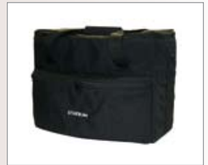
Travel Case (Merlin) 801-7902