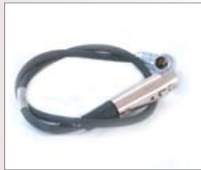
Moviecama power cable 250-0054