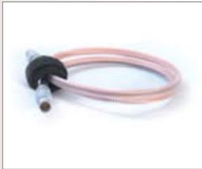
7 pin to 7 pin HD monitor cable, RGB/DATA 252-0116