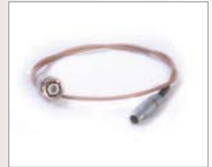
7 pin to BNC HD/SDI cable 252-7922