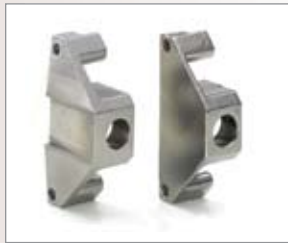
Socket block (female) 250-7233 titanium (left) 078-0419 steel (right)

Genuine Steadicam parts and accessories to keep your Steadicam original.