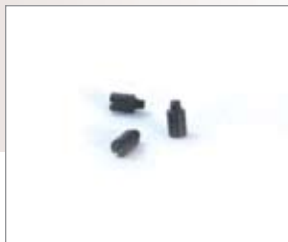
Camera locating pin screws (Flyer) 600-2005