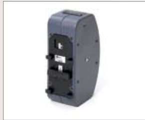
24 volt NiMH Tiffen battery with built-in meter 252-7300