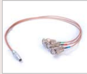
HD 7 pin to 3x BNC RGB/DATA breakout 252-0117