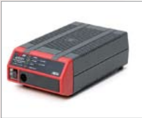
PAG 12/24 volt battery charger with auto 100-135 V/180-265 V input selector MSC-089940