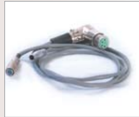
12v power and modulus power combo cable 300-7903