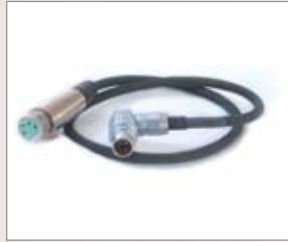
12v isolated power cable 250-0056