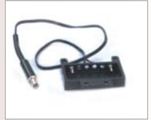
12v battery charger cable with mini jack 250-0060