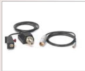
Triax interconnect kit (Kings connector) 250-7837