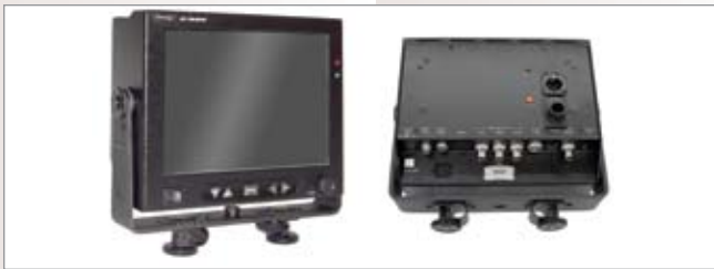
HD Ultra Brite 8.4" Hi-Def component/composite/NTSC/PAL LCD color monitor Includes yoke with 3/8-16 mount and 0.625" rod mounts (front and back panels shown) 255-7550