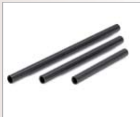
3A/EFP arm post 083-0160-2 12" arm post 083-0160-3 9" arm post 083-0160-4 6" arm post