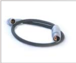
Panavision power cable 250-0049