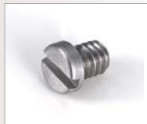
1/4-20 camera mounting screw 078-1121