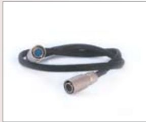
Modulus power/video cable 250-0051