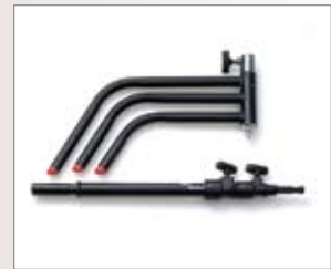
"C" stand with turtle base FGS-900041