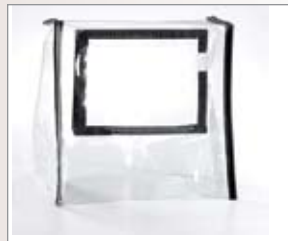
HD UltraBrite monitor rain/dust cover FGS-900093