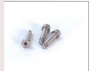
Ultra & "Master Series" low-mode gimbal screws SCW-148837