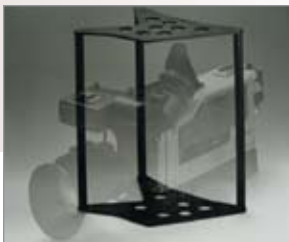
Video low mode cage with 12" rods 078-2038-01