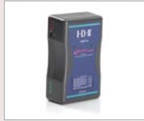
IDX Endura E10S 12 V lithium ion battery with meter FFR-000002