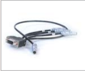
SIETZ interface cable - master series 250-0052