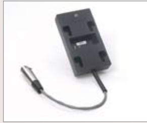
24 volt battery charger cable (Pag to Tiffen 24 V battery) 252-7915-01