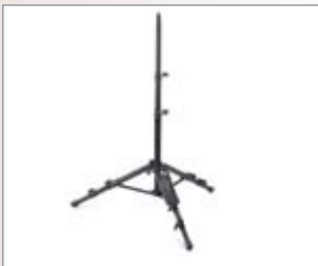
Steadistand lightweight "C" stand 601-7910