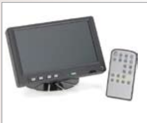
7" widescreen color LCD monitor 16:9/4:3 NTSC/PAL 1/4-20 mount, with remote 602-7500