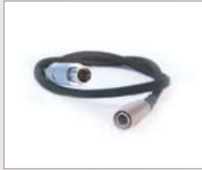
Coherent power & video cable 250-0055