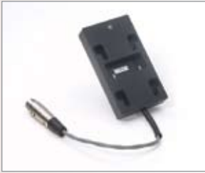
12 volt battery charger cable (Pag to Tiffen 12 V battery) 252-7915