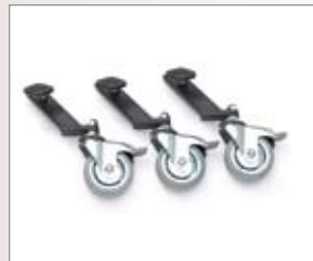
Wheel set (for American stand) FGS-900074