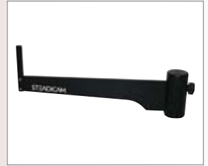
Tripod / "C" Stand Docking Bracket (Merlin) 801-7900