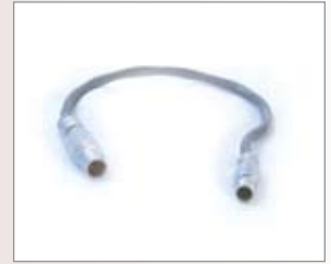
panavision millenium XL power cable 252-0054