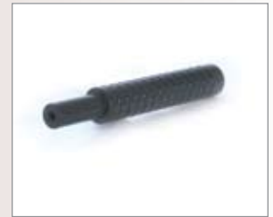
Ultra/MS arm to ProVid sled, adapter post 250-7974