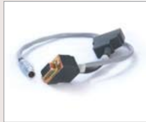
WRC-4 interface cable - master series 250-0053