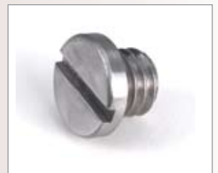
3/8-16 camera mounting screw 078-1122