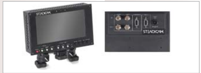
7" widescreen 16:9/4:3 HD/SDI/NTSC/PAL LCD color monitor 1/4-20 mount (front and back panels shown) 255-7500 (shown with optional 0.625" rod and 1/4-20 mount 800-7525)