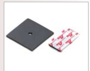
PD-150 (Sony) weight kit for JR 178-2016