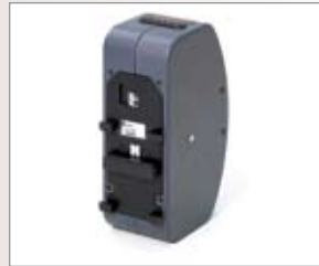
12 volt NiCd Tiffen battery with built-in meter 250-7300