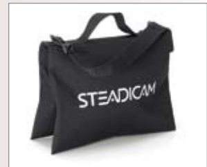
Steadicam logo dual zippered pocket sandbag with shoulder strap FFRR-000014