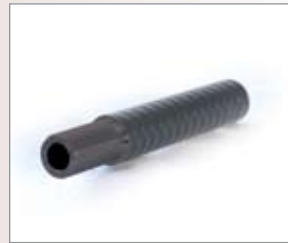
Ultra/MS arm to 3A/EFP sled, adapter post 250-7975