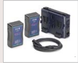
IDX E10S starter kit 2 Endura E10S lithium ion batteries and VL-2 Plus Charger FFR-000022