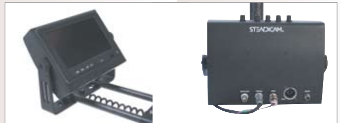
7" 700nit color LCD monitor with tally light, 1/4-20 mount. Shown with optional yoke/rod mount 302-7500-01 with framelines built-in 302-7500 without framelines