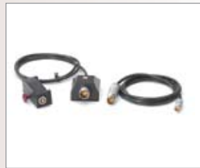
Triax interconnect kit (Fischer connector) 250-7837-01