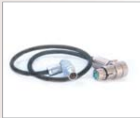
12v camera power cable 250-0045