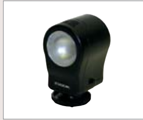
Battery Operated Obie Light (Merlin) FFR-000030