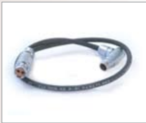
ARRI 24v power cable 250-0093