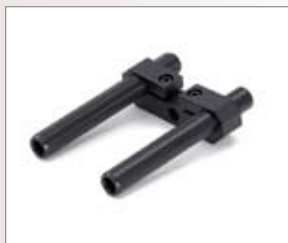
15 mm motor rod set (2 rods and mounting bracket) 250-7915