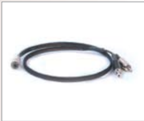
Waterc video top power & video cable 250-0076