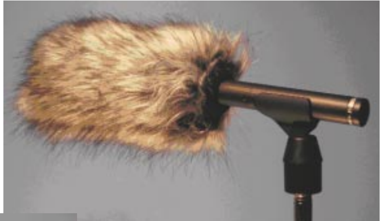
NTG-2 with "Dead Cat".

While not as wildly innovative in appearance as the VideoMic, they are still different enough in appearance to have their own identity. The mic is supplied in a great carrying pouch, with a standard mic-stand (not suspension) mount, and a foam windscreen for moderate wind conditions.