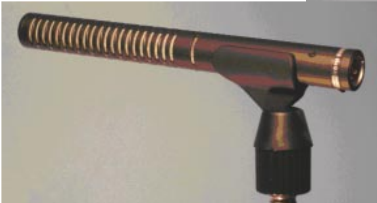
A naked NTG-1.

A suspension mount is absolutely essential when this mic is mounted on a boom, but RØDE has you covered. By the time this article is published, RØDE expect to have their own affordable suspension mount available for separate sale. I've seen it, and it's a little ripper.